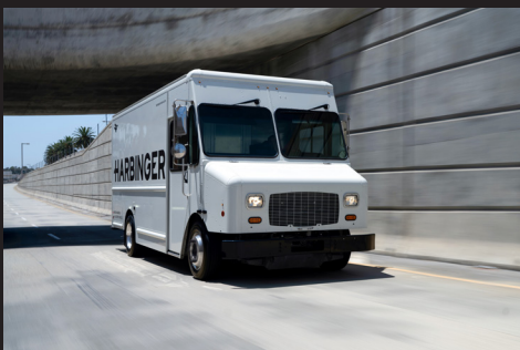
Step Van (Walk-In Van)